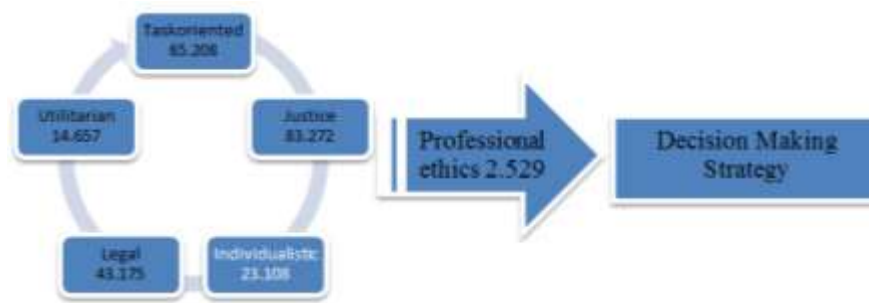
Fig. 3. Results of SEM fitness and the absolute t-values of paths